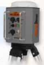
Outback AutoMate Automatic boom control