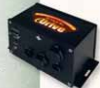
Outback S3 Advanced GPS Guidance